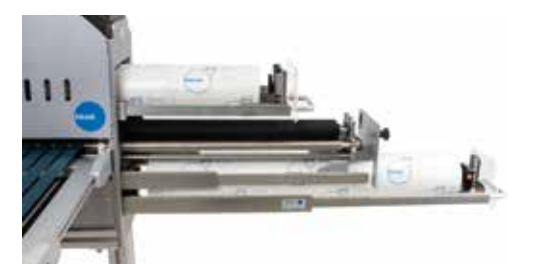
Low Static Cleaning