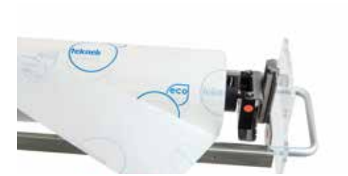
Low Static Adhesive