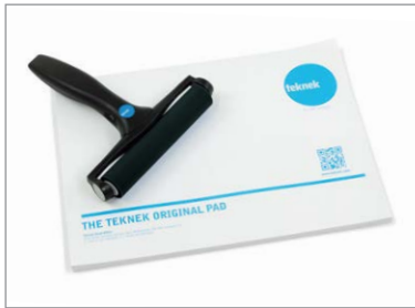
NT™ with paper pad - 50 sheets per pad