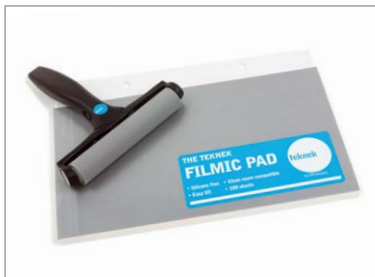
Nanoclean™ with Filmic pad - 100 sheets per pad